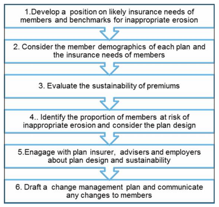
Figure 2: Process map for creating sustainable designs

This paper has argued that to ensure an insurance design is sustainable, the following steps should be considered by trustees: